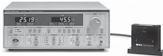
The LDC-3714B and LDM-4407 mount: Ideal for precision control of low power laser diodes.