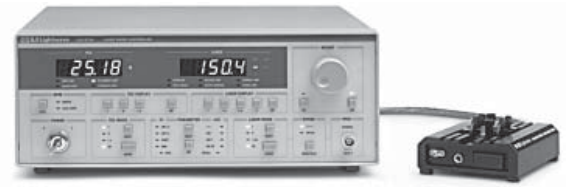
The LDC-3724B and LDM-4980 mount: An unbeatable combination for controlling low to medium power laser diodes.